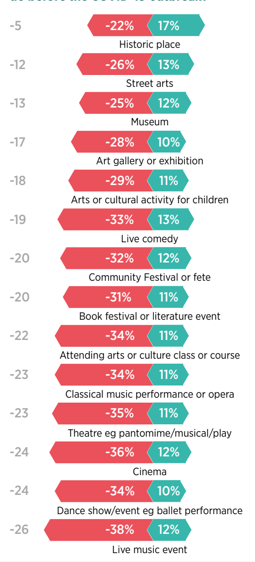
Figure 5: How have your preferences changed compared with what you might have chosen to do before the COVID-19 outbreak?

Respondents were asked how their appetite for different cultural activities had changed since the COVID-19 outbreak, with a range of options possible ('more likely to consider', 'no difference', 'less likely to consider' and 'would not have considered before and still would not'). Demand for all stated cultural activity is suppressed, from a net reduction of 5% for visiting an historic place to a net reduction of 26% for attending a live music event (Figure 5).