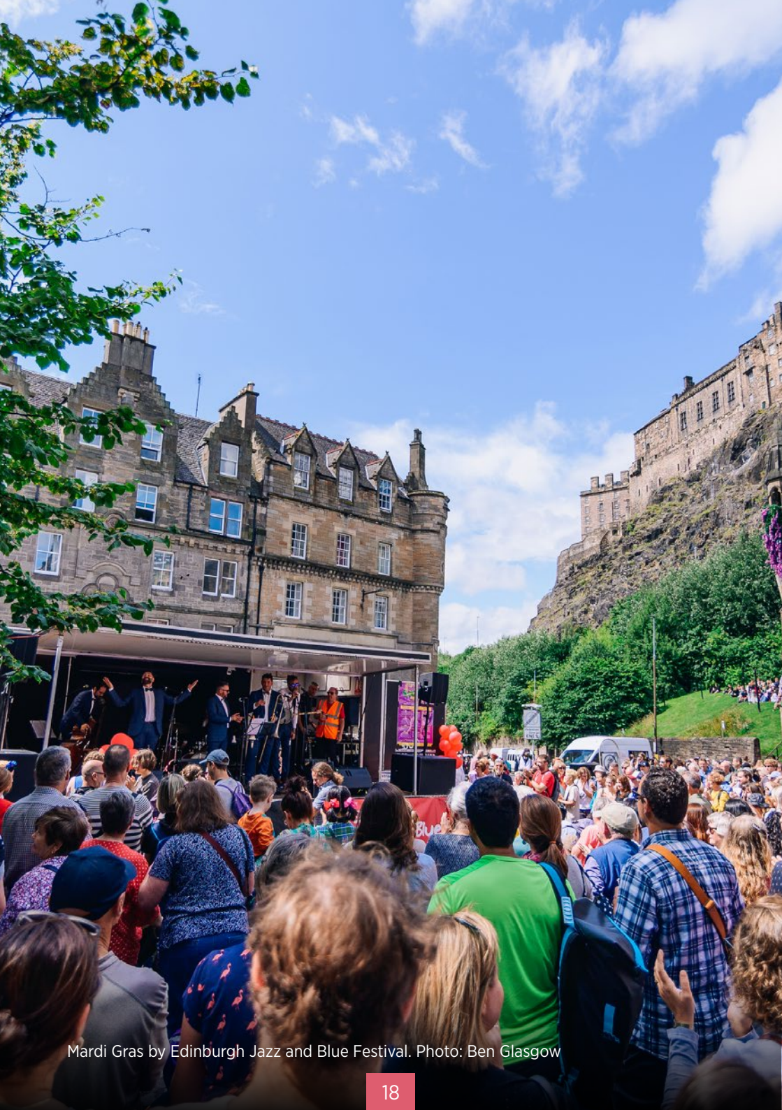
Mardi Gras by Edinburgh Jazz and Blue Festival.