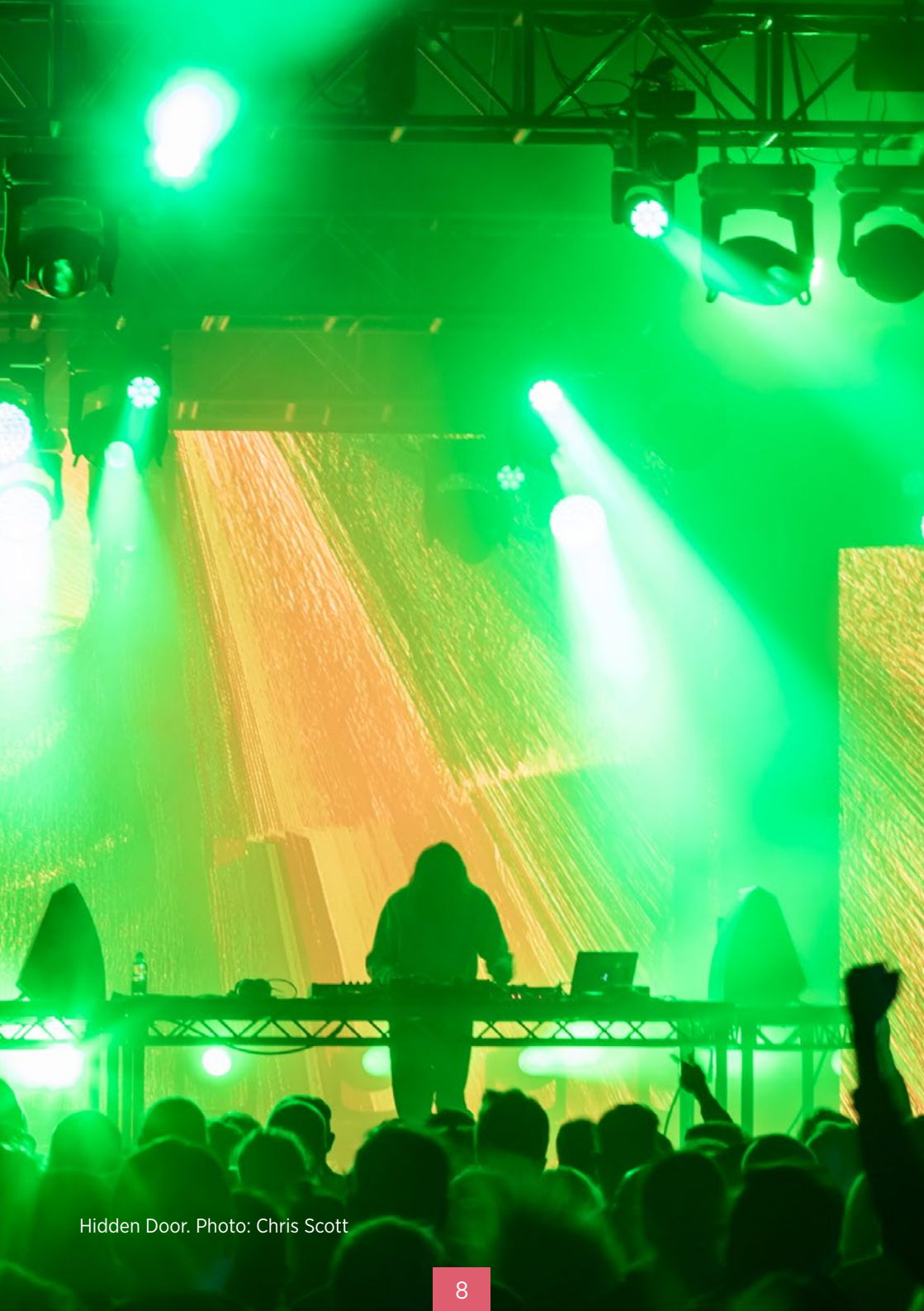
Hidden Door.