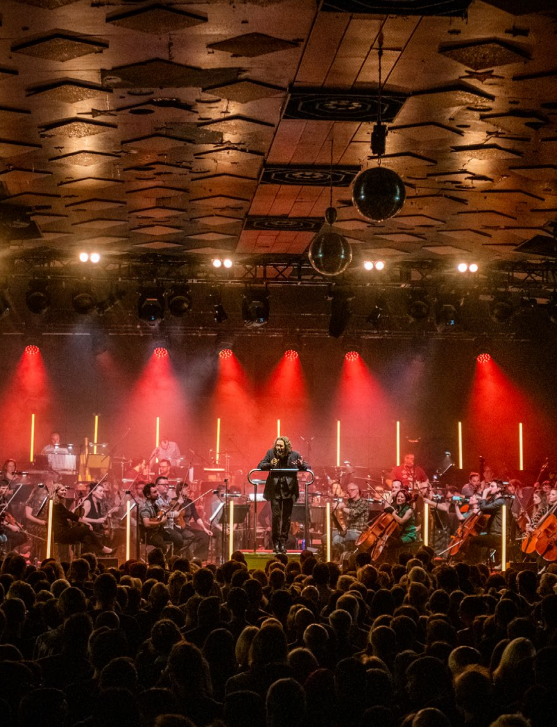
Grit Orchestra at Barrowland Ballroom, Celtic Connections.