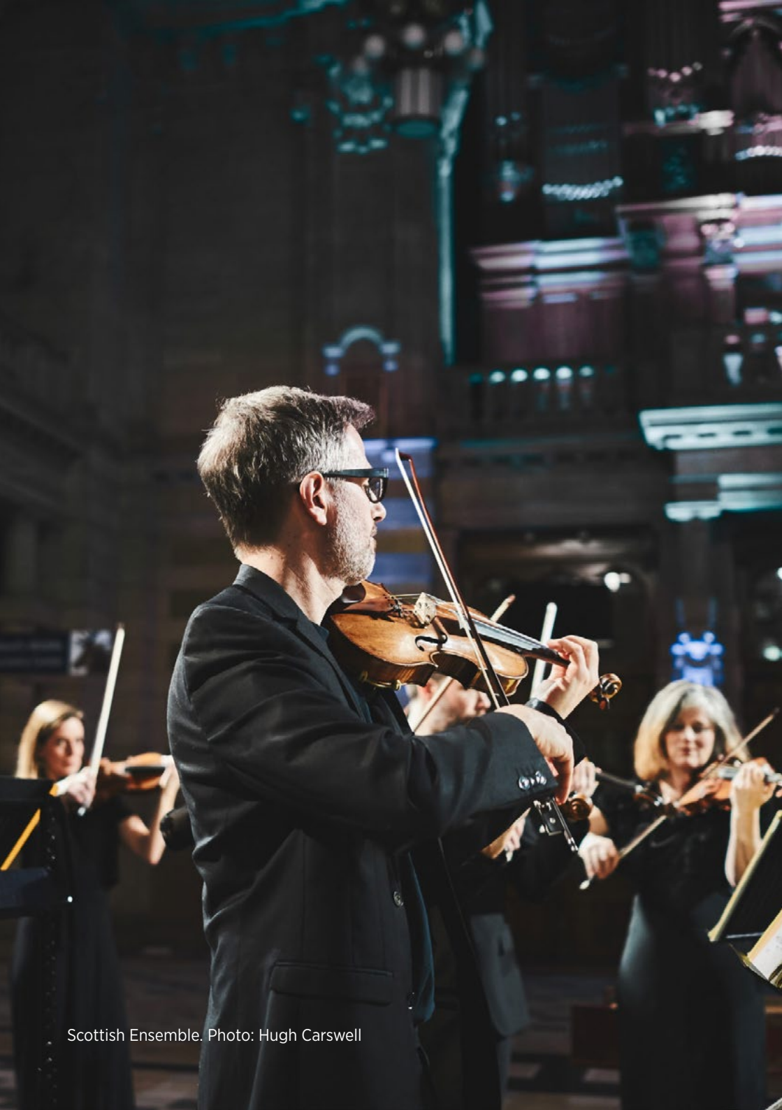
Scottish Ensemble.