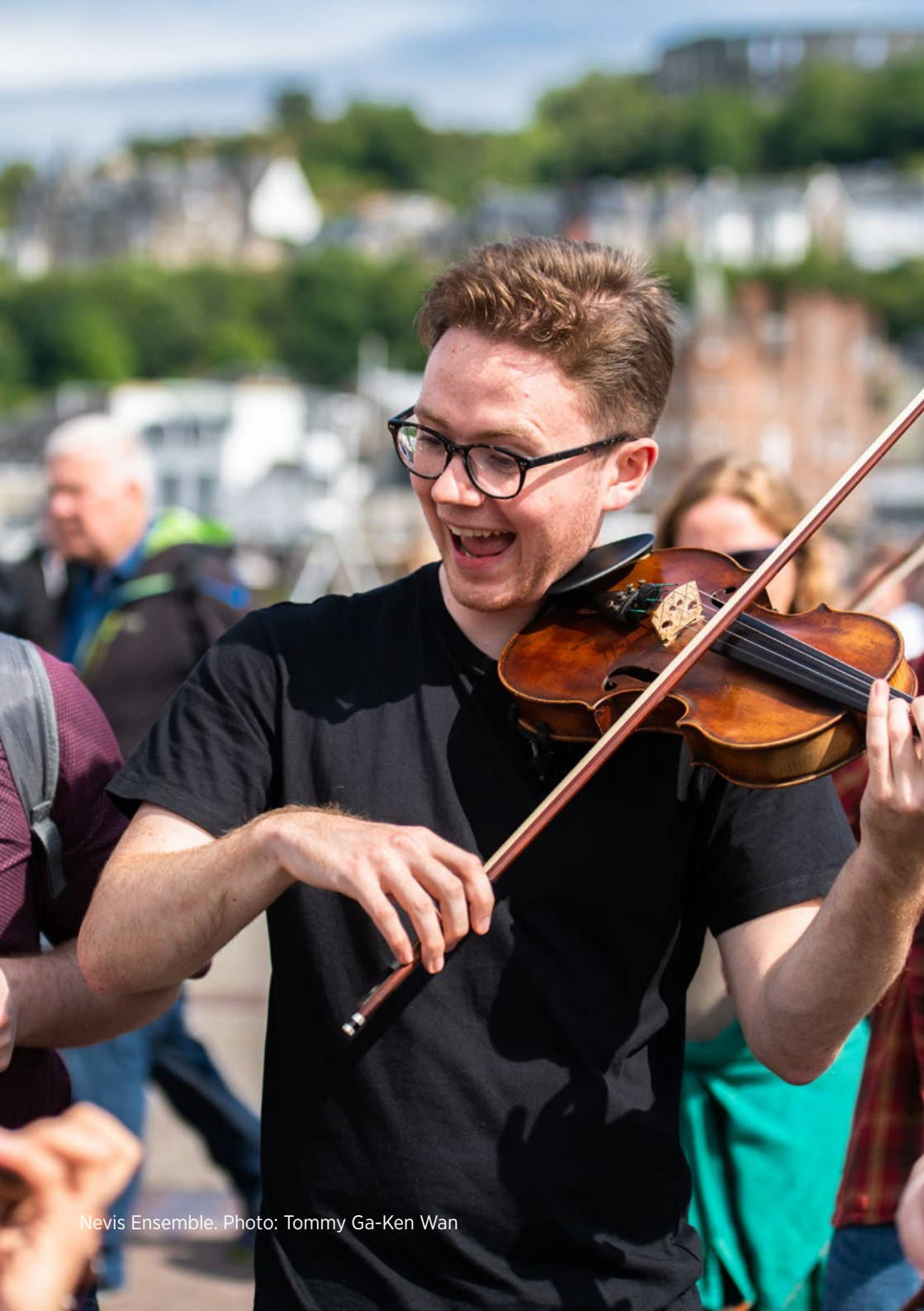
Nevis Ensemble.