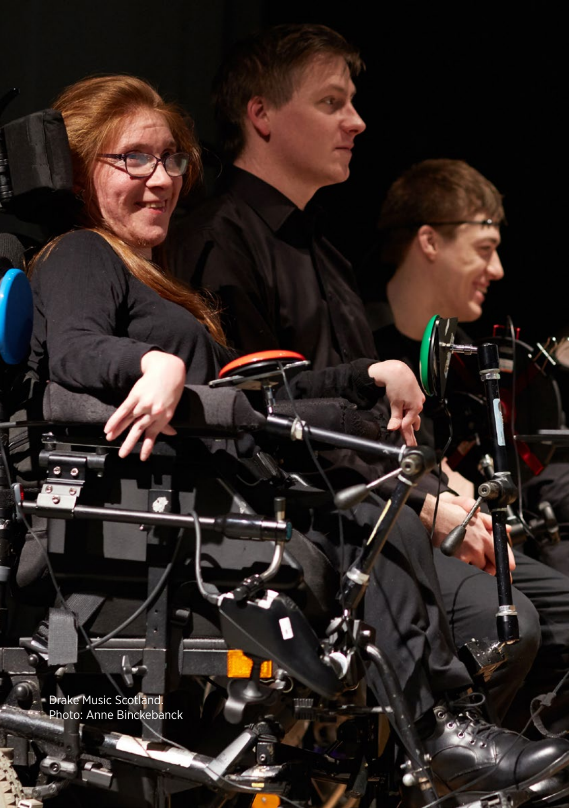
Drake Music Scotland.