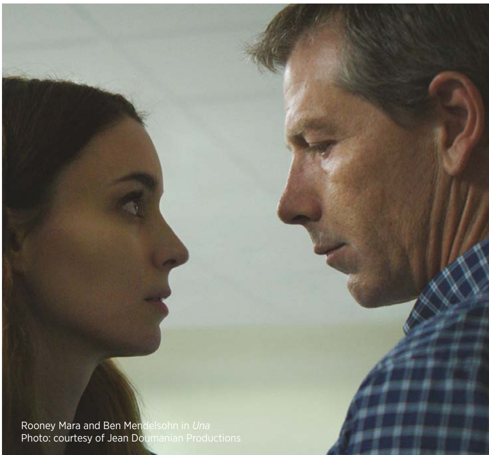
Rooney Mara and Ben Mendelsohn in Una