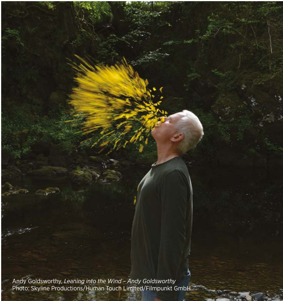
Andy Goldsworthy, Leaning into the Wind – Andy Goldsworthy