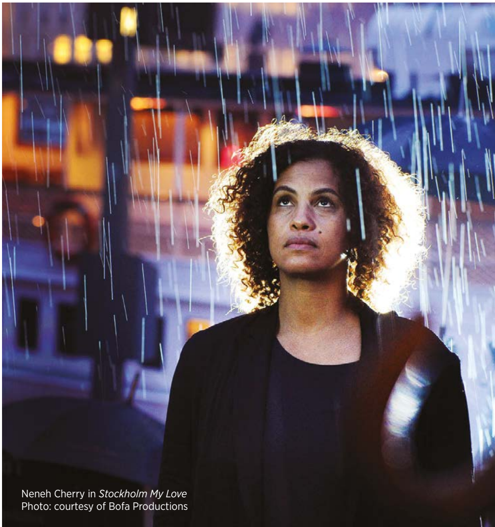
Neneh Cherry in Stockholm My Love