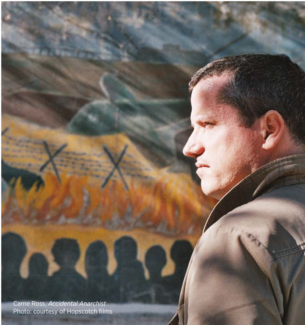
Carne Ross, Accidental Anarchist