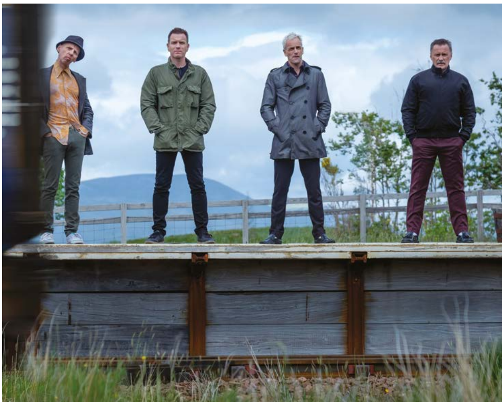
Ewan McGregor, Ewen Bremner, Jonny Lee Miller and Robert Carlyle, T2 Trainspotting