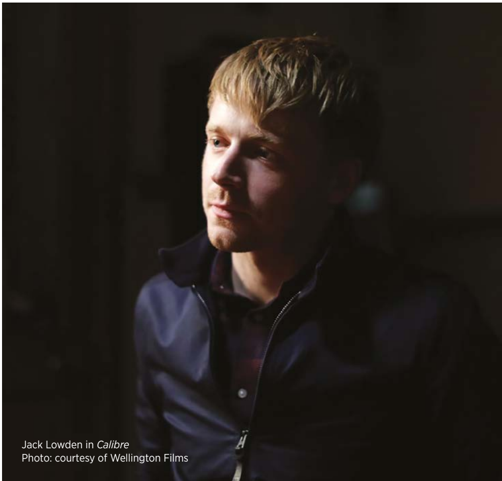
Jack Lowden in Calibre