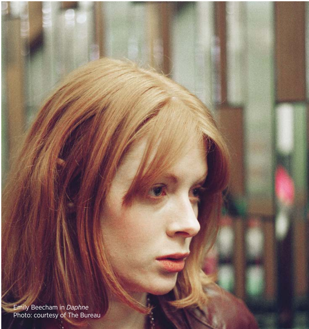
Emily Beecham in Daphne