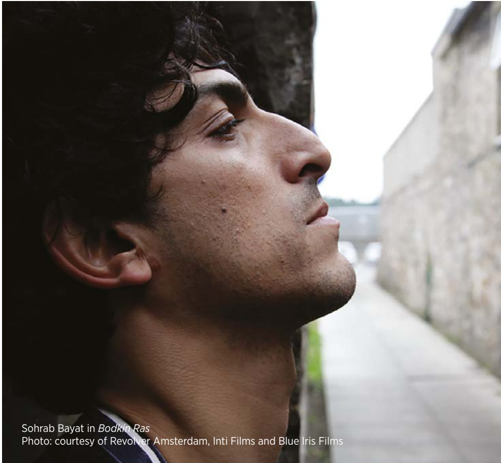
Sohrab Bayat in Bodkin Ras