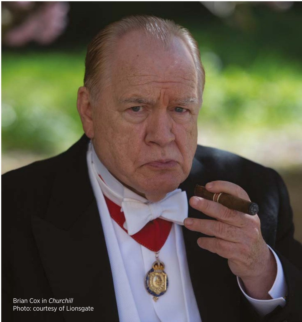
Brian Cox in Churchill