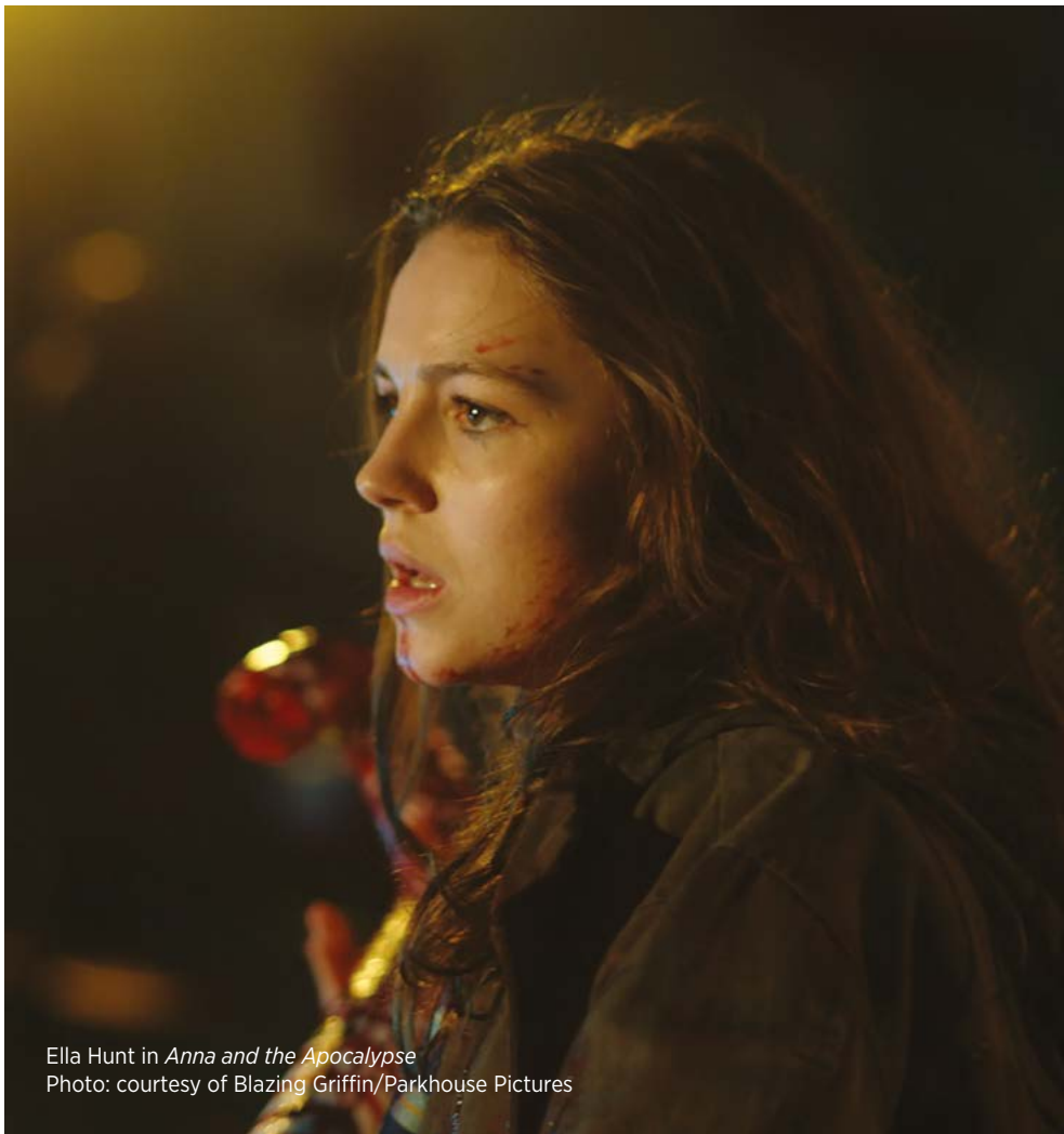
Ella Hunt in Anna and the Apocalypse