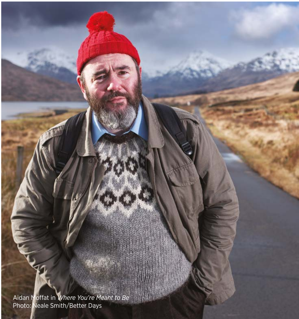
Aidan Moffat in Where You're Meant to Be